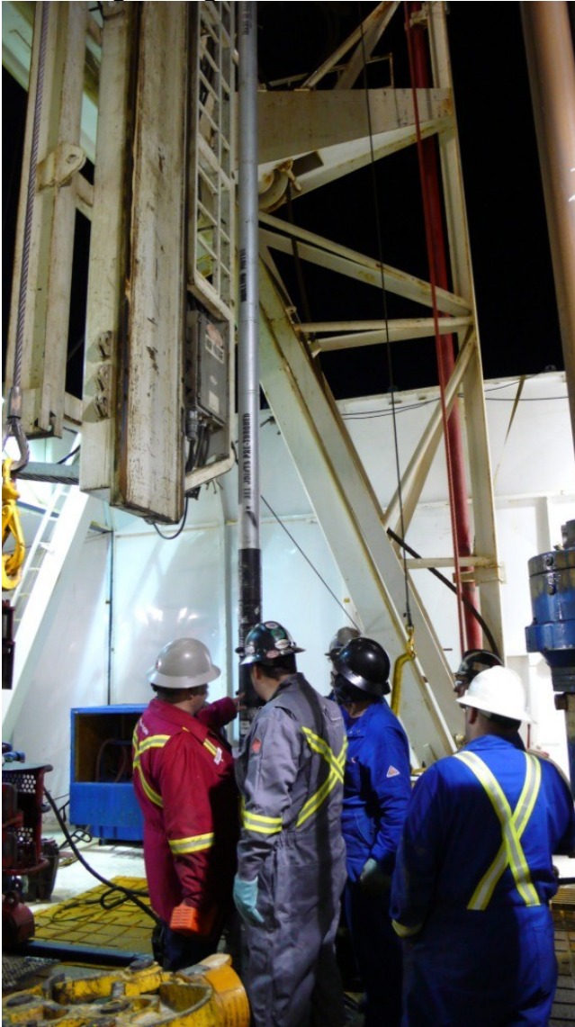
3 – Setting the angle of the bent sub